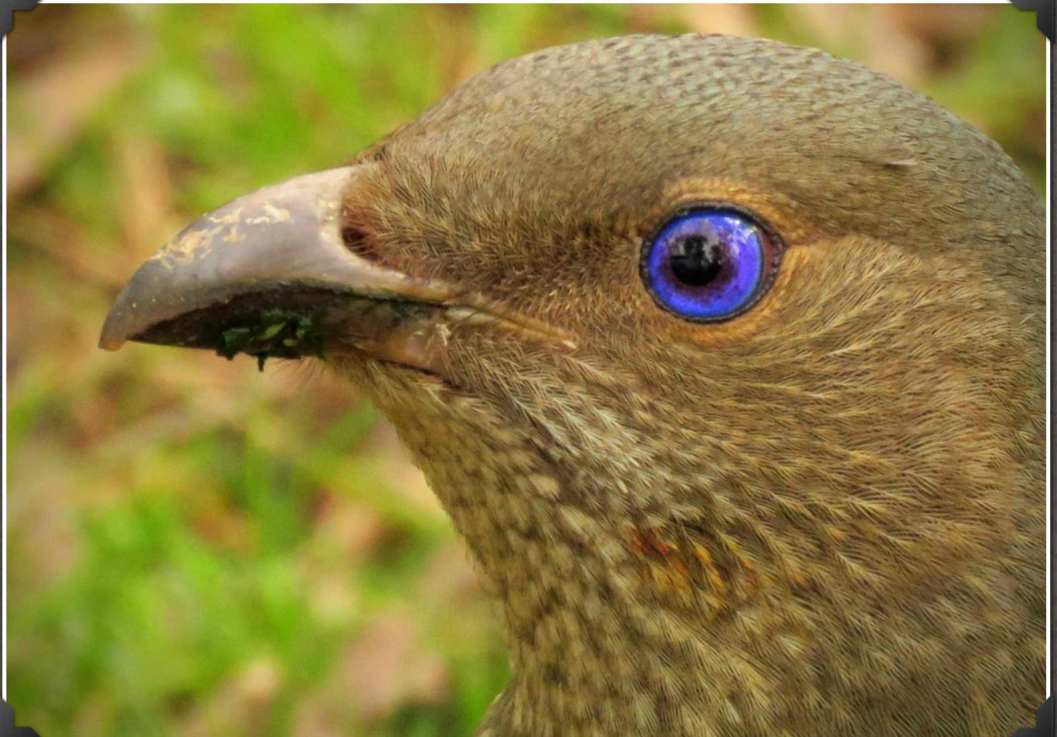
FEMALE SATIN BOWERBIRD