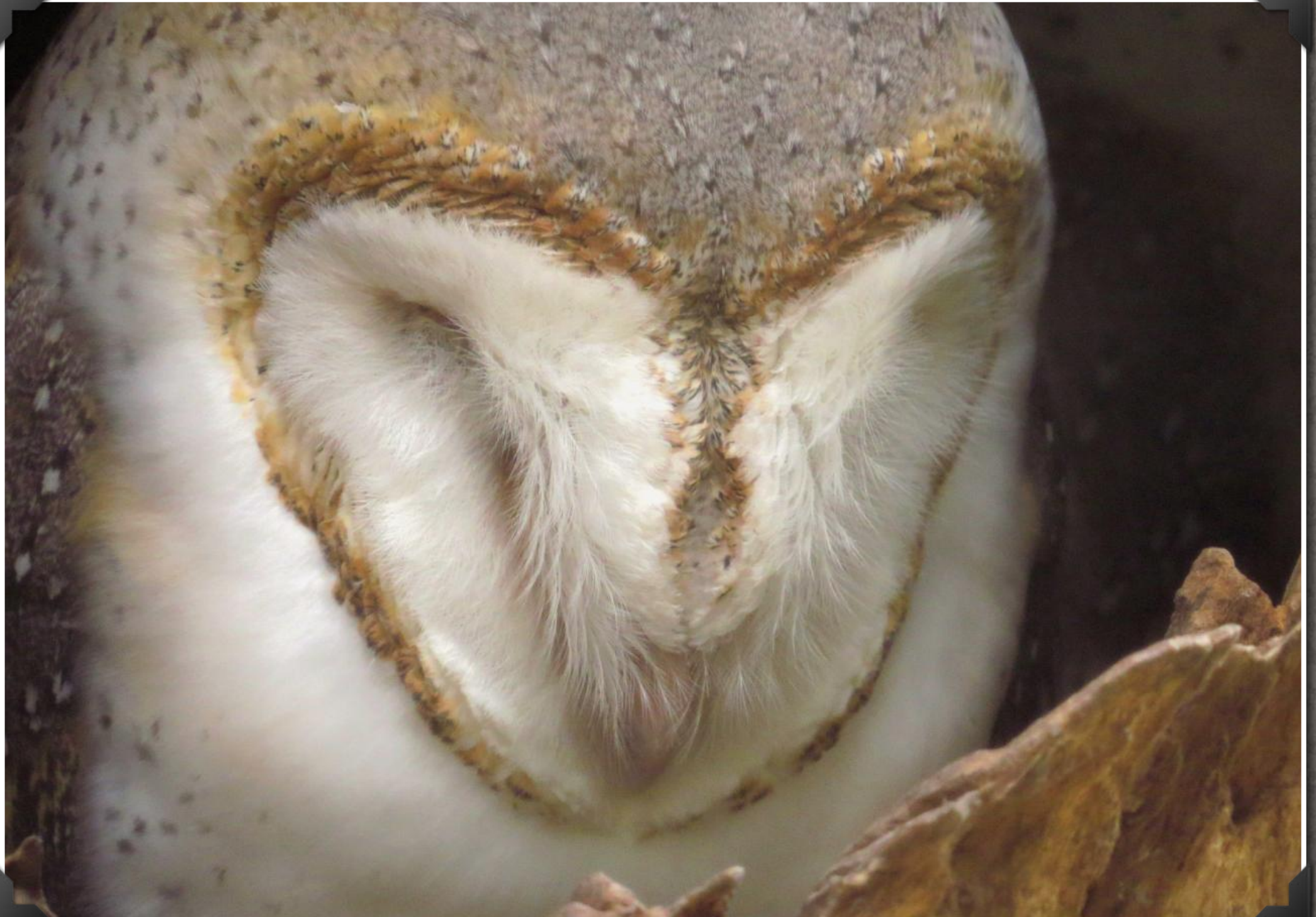
SLEEPING BARN OWL