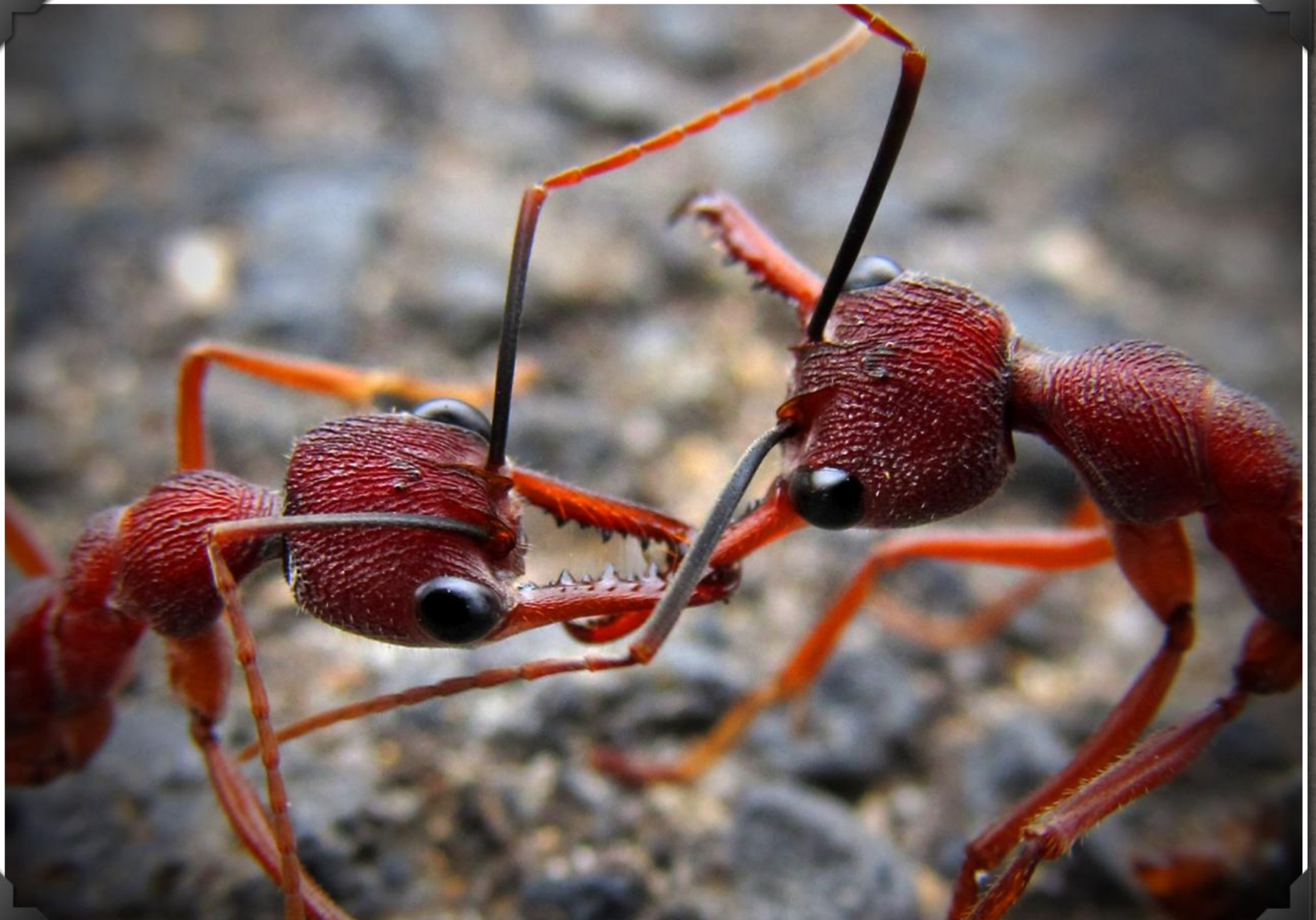
GIANT RED BULLANTS FIGHTING