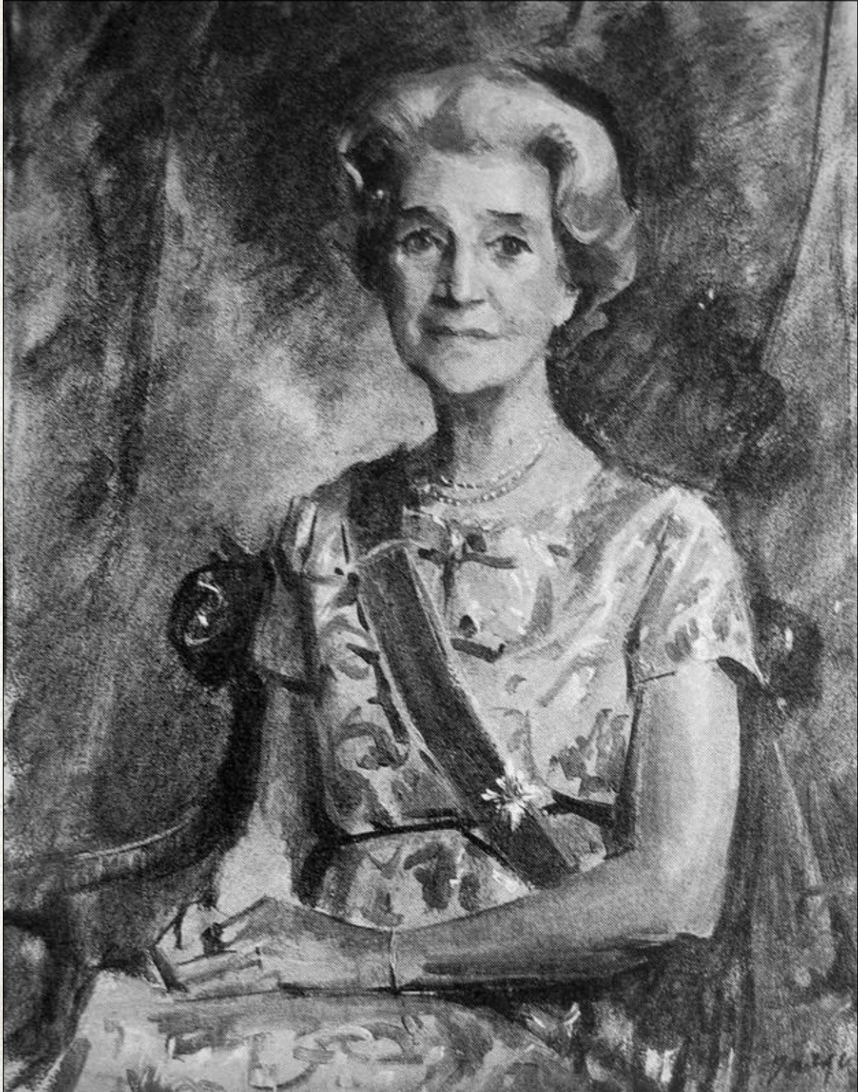
Portrait painted by William Alexander Dargie (1912-2003)