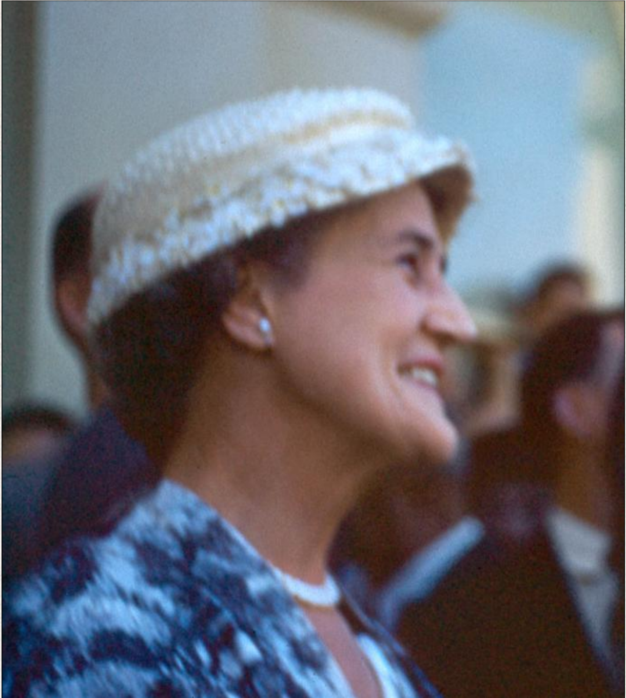
Dame Pattie Menzies at the Back-to Alexandra celebrations in 1958