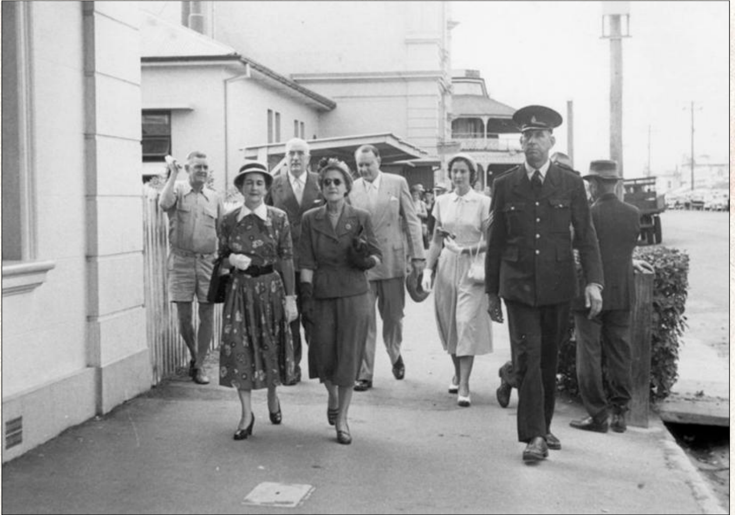
Prime Minister Robert Menzies' wife Pattie and daughter Heather in Bundaberg in 1953