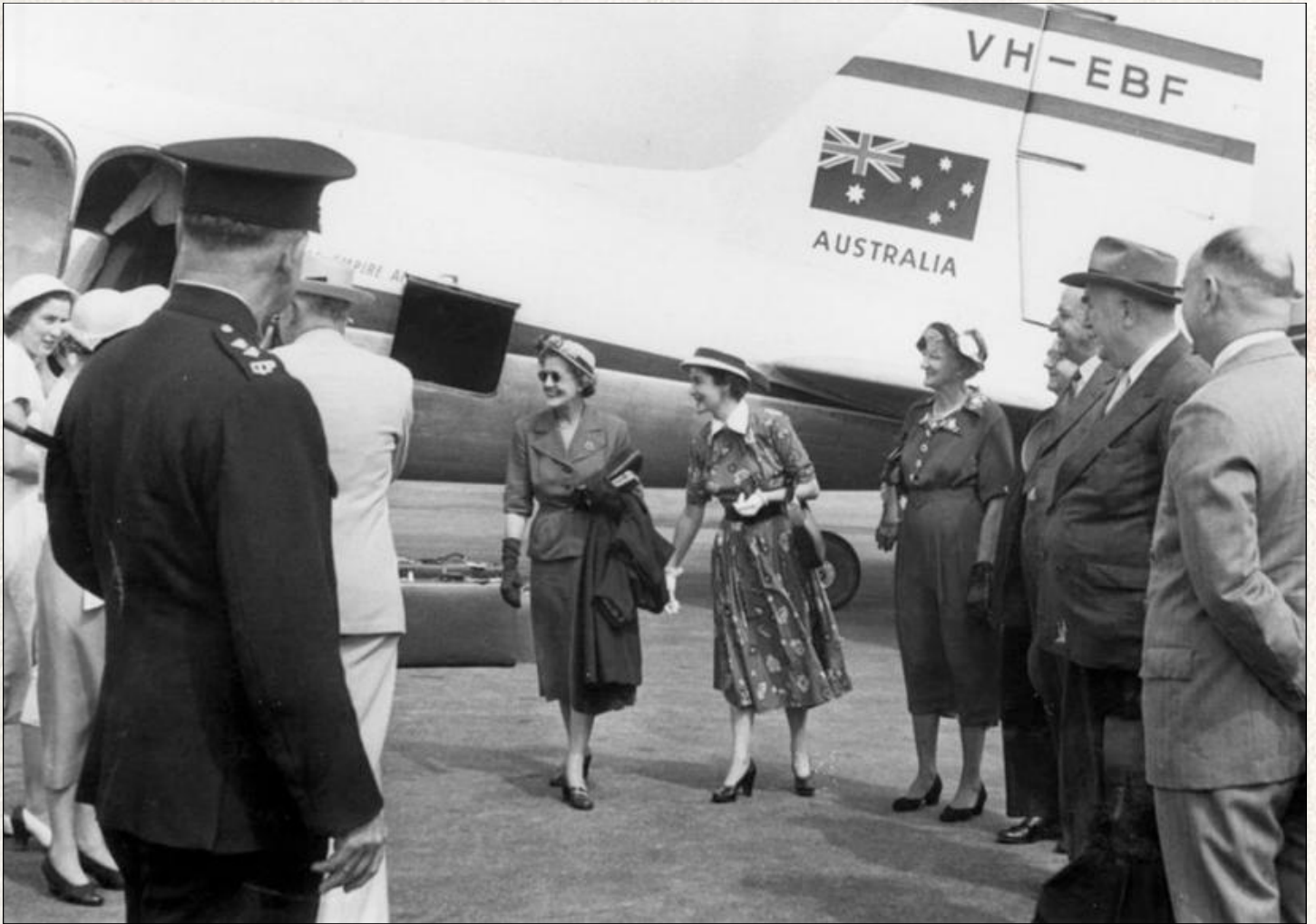
Prime Minister Robert Menzies and his wife Pattie arrive at Bundaberg Airport in 1953