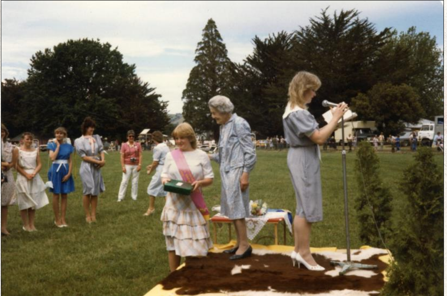
Dame Pattie Menzies presenting a ribbon at the 1983 Alexandra Rural Show Centenary