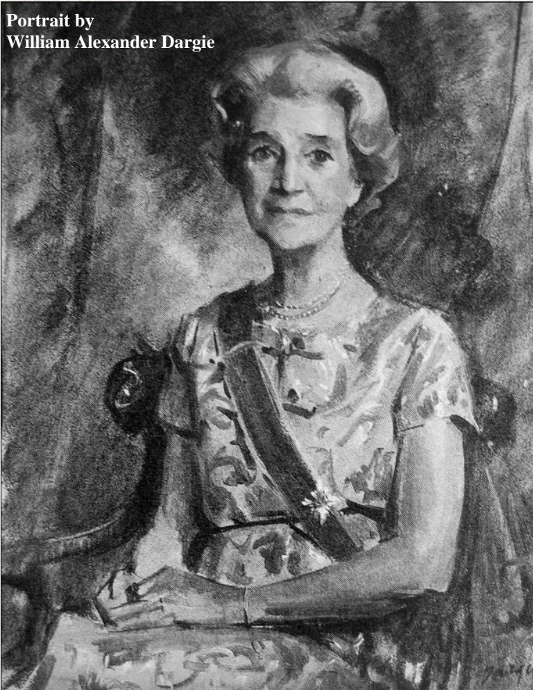
Portrait by William Alexander Dargie

In 1955 Dame Pattie had her portrait painted by respected artist William Alexander Dargie (1912-2003). William holds the record for winning eight Archibald prizes. He was also an official war artist during WWII.