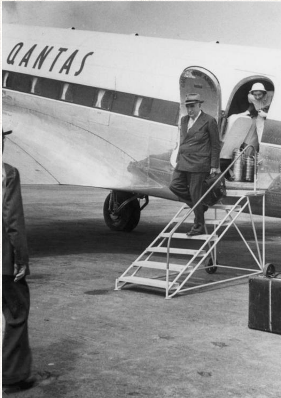
Prime Minister Robert Menzies and his wife Pattie arrive at Bundaberg Airport in 1953