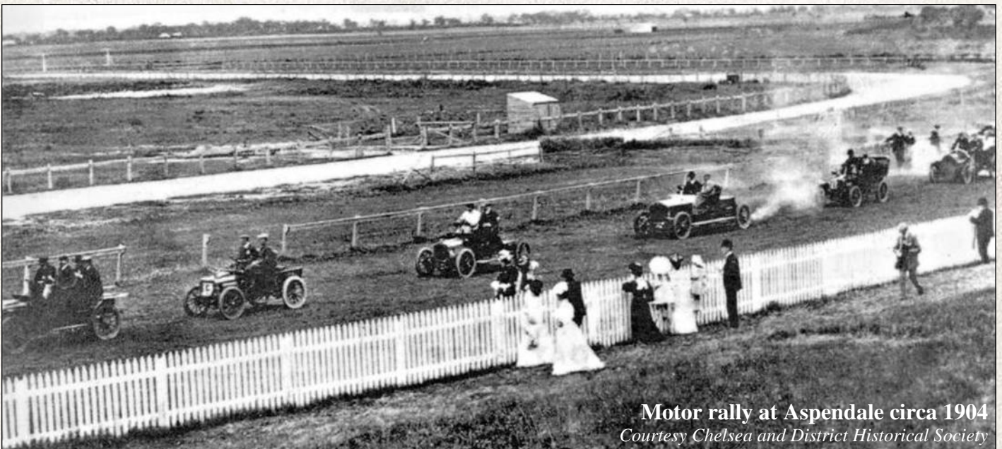
Motor rally at Aspendale circa 1904