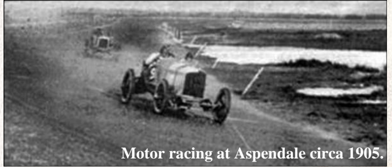
Motor racing at Aspendale circa 1905.

The club was set up to accommodate anyone with a motoring interest, regardless of whether that was motorised vehicle or bike.