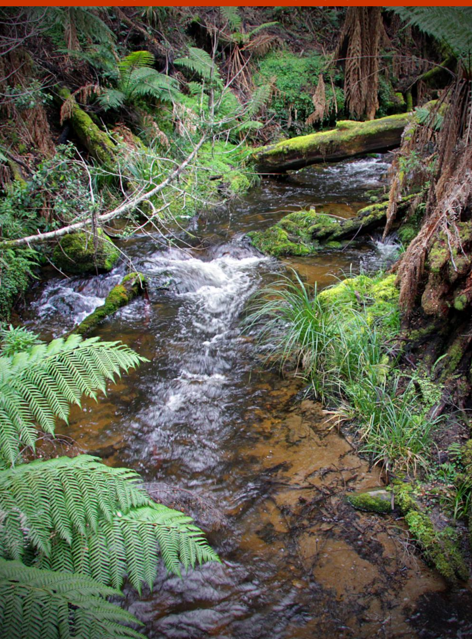
The Cumberland Creek above the Cumberland Falls