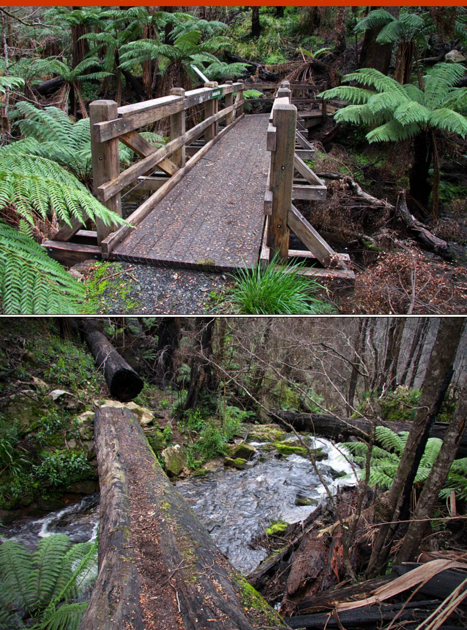
(Top) A bridge on the way to the Falls - (Bottom) A log near the top of the Falls