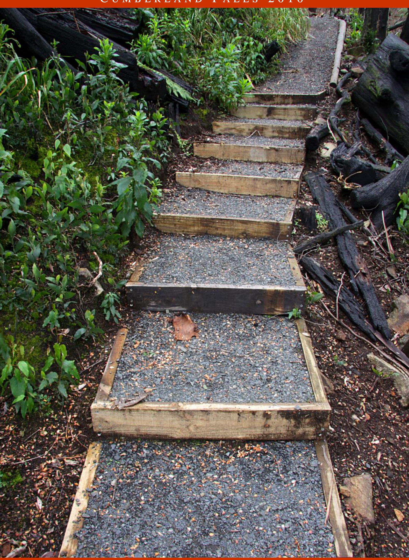
Steps leading down to the viewing platform