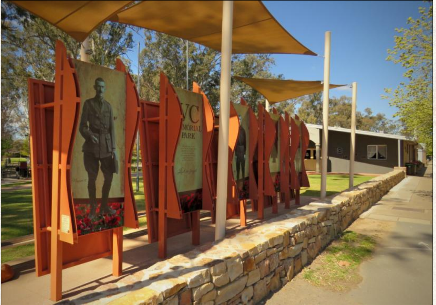
The VC Memorial Park at Euroa in 2015