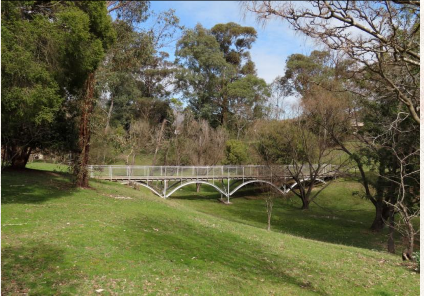
Silver bridge in August 2019