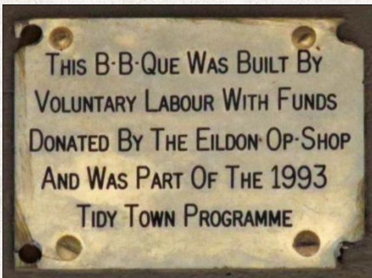
Gum Tree Gully Reserve former BBQ area, October 2015