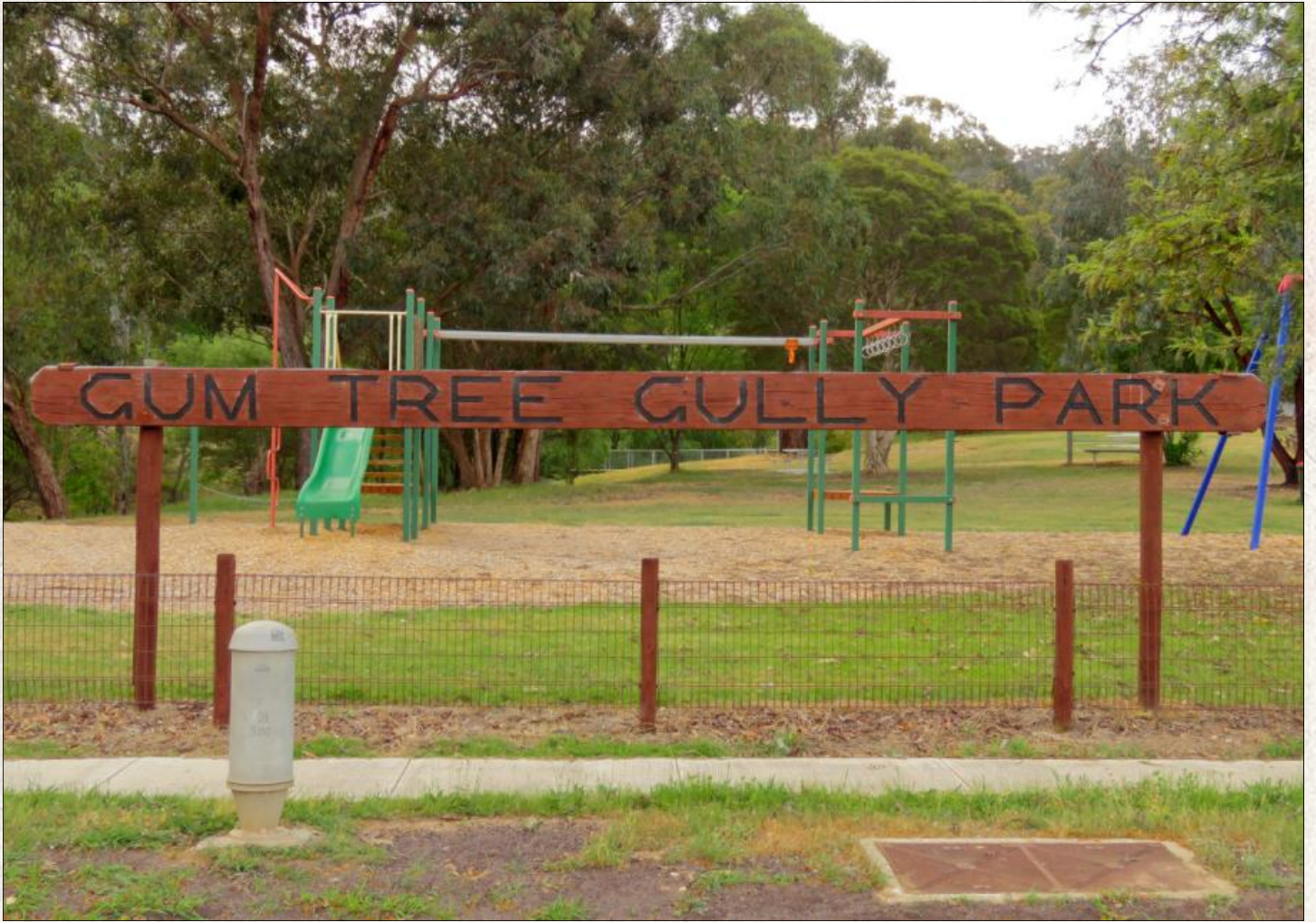
Gum Tree Gully Park, October 2015