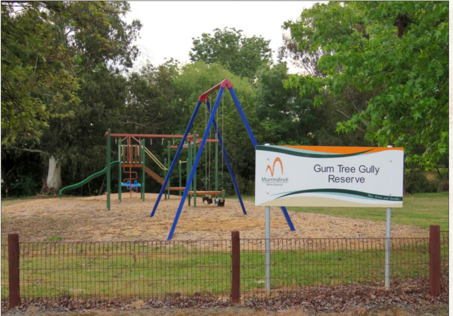
Gum Tree Gully Reserve, October 2015