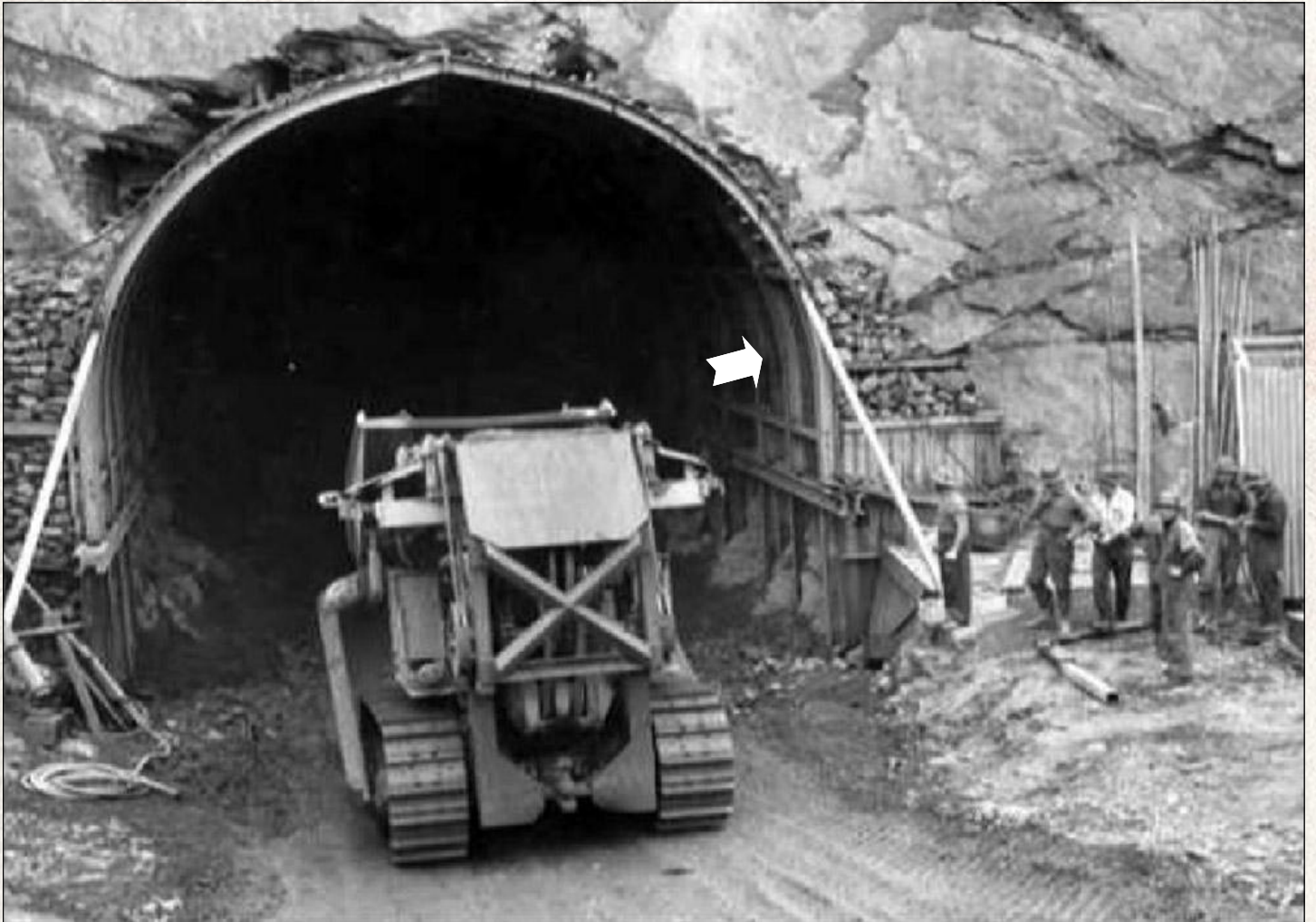
Steel curved sets visible at the start of the tunnel being constructed for a large water pipe