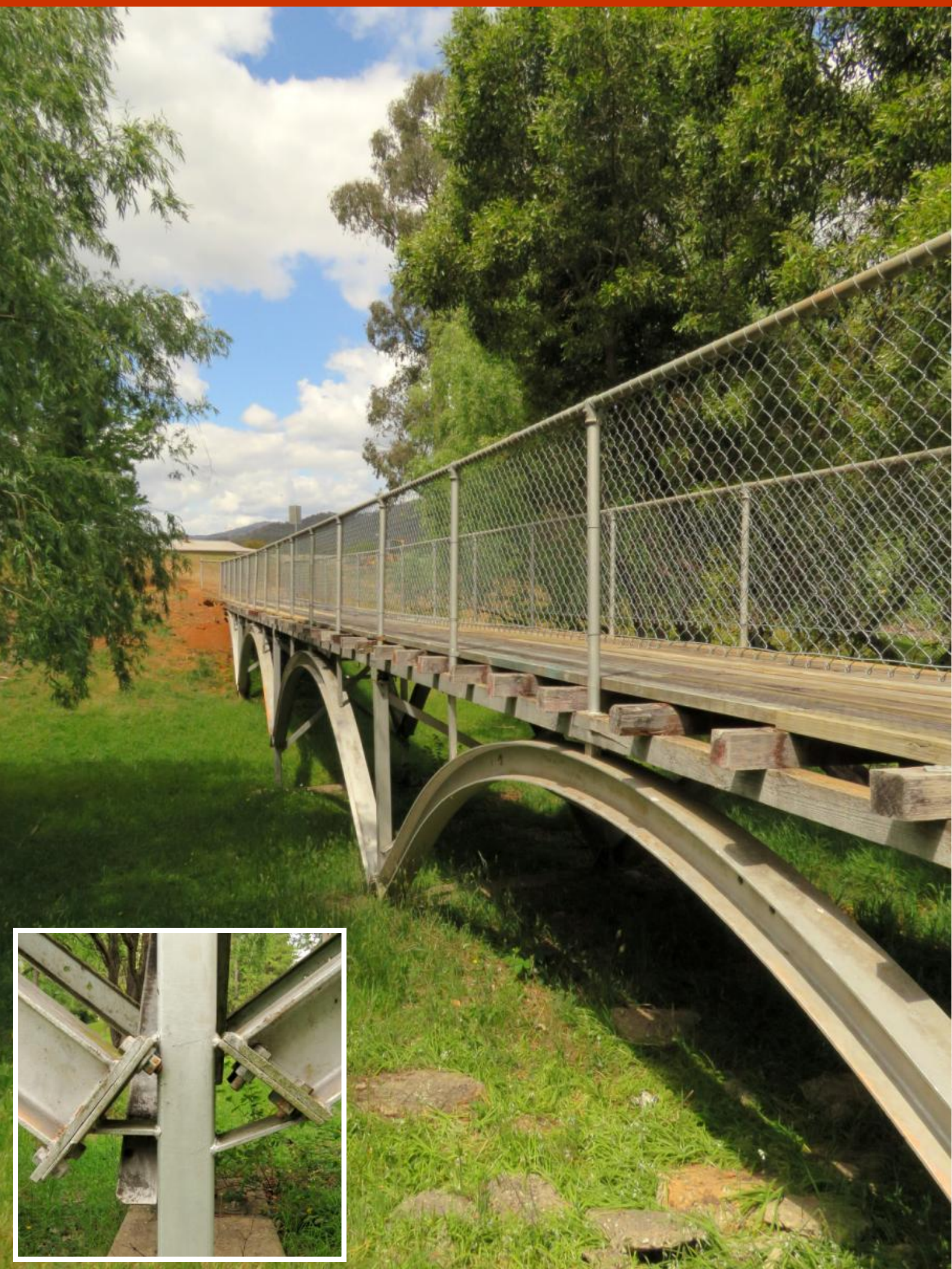
Chain mesh hand railings.