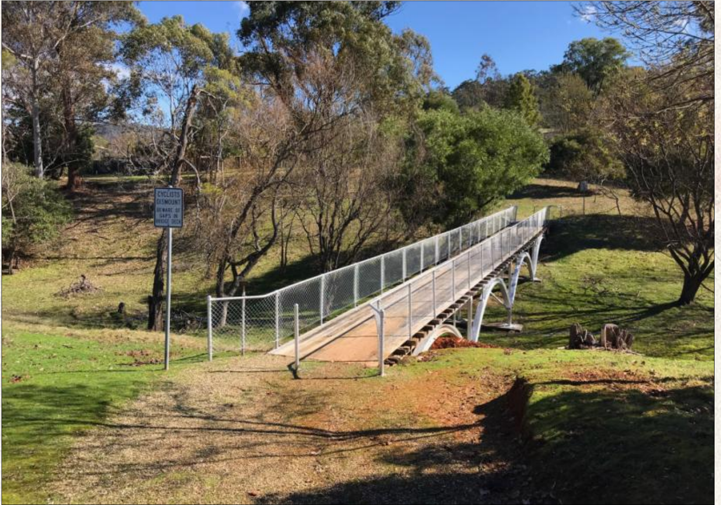
Silver bridge after being repainted in July 2018