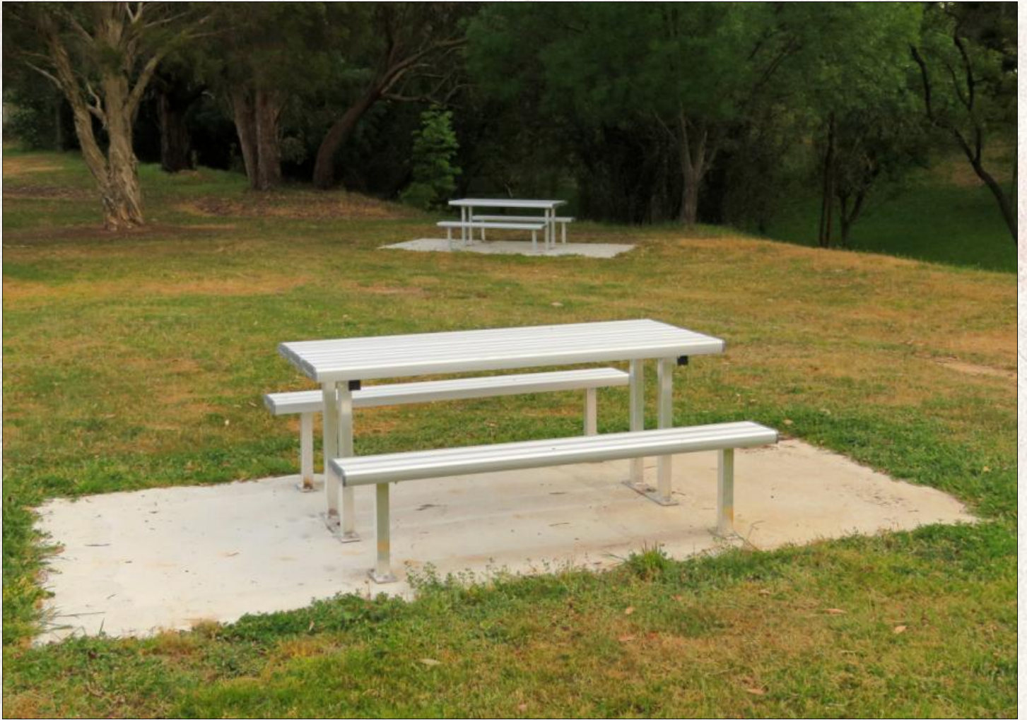
Two tables at Gum Tree Gully Reserve. These are two of eight tables established around Eildon by the Shire of Murrindindi in mid 2015.