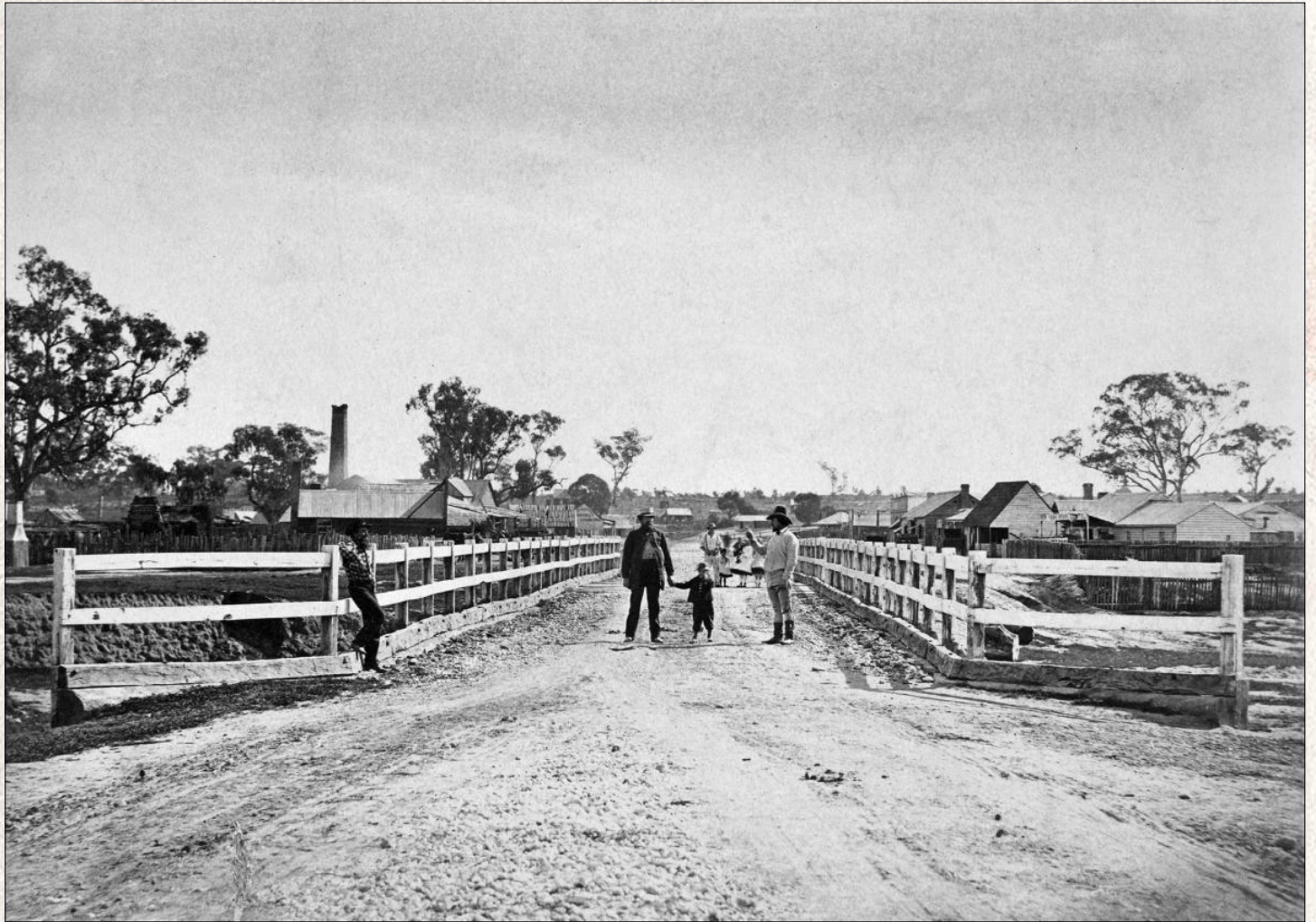
McCallums Creek bridge near Majorca circa 1866