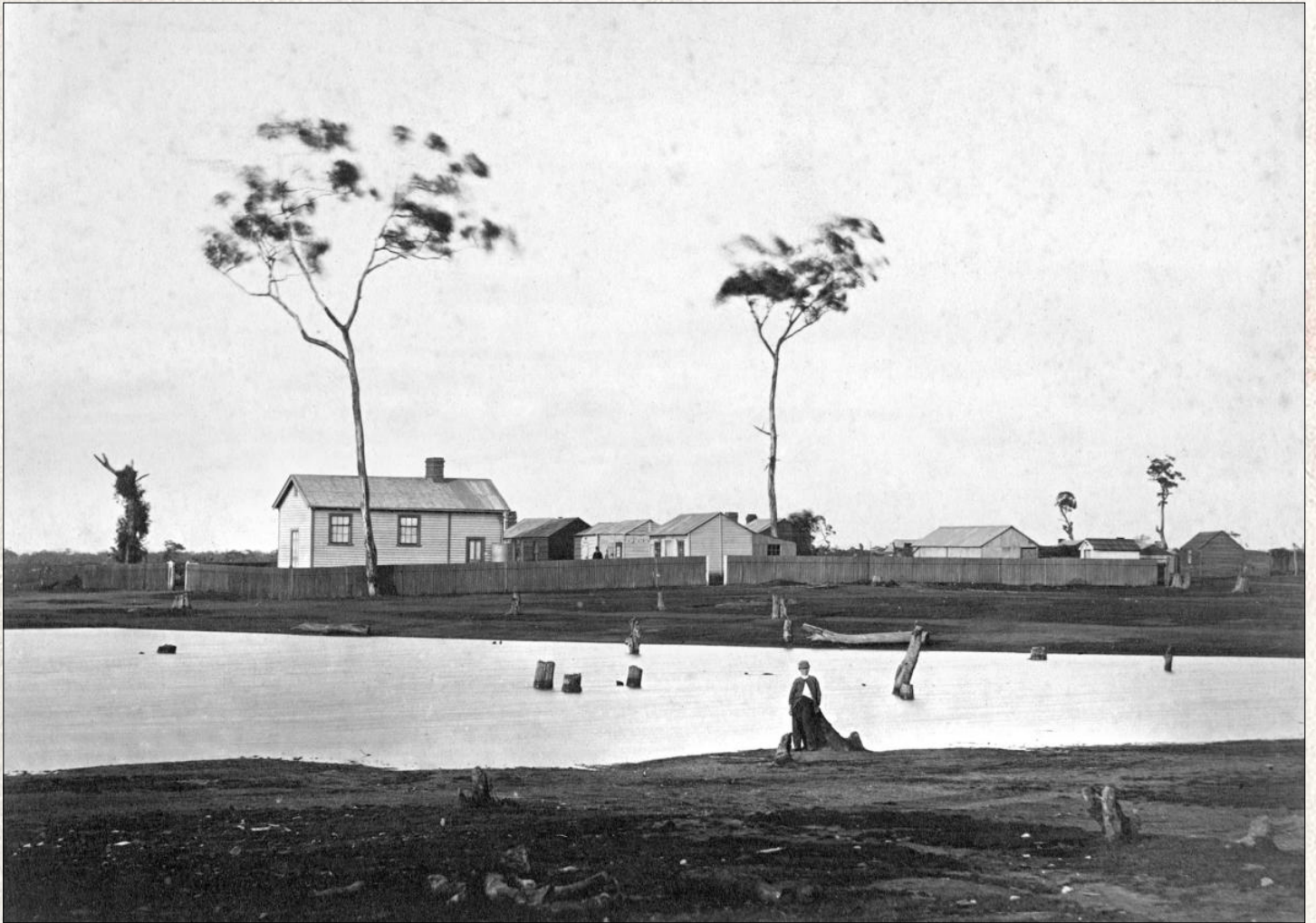
Buildings near Majorca circa 1866